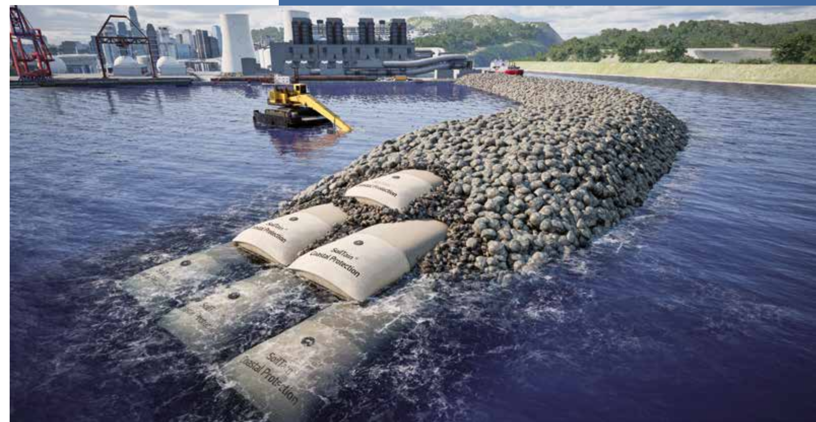
Products: SoilTain® CP Tubes