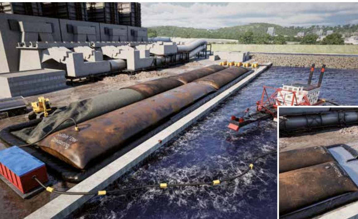
Products: SoilTain® DW, SoilTain® Bags as pollutant filters