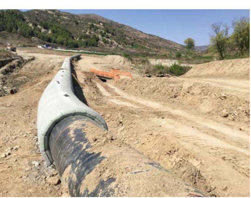
Trans Adriatic Pipeline (TAP) Greece/Albania: protection of pipe against buoyancy, uplift and mechanical actions with Incomat Pipeline Cover.