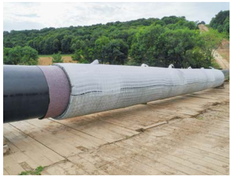
Val de Saône, DN 1200 France: protection of pipe against buoyancy, uplift and mechanical actions with Incomat Pipeline Cover.