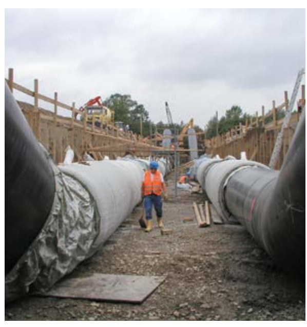
Ruhr inverted siphon, DN 1400 Germany: protection of pipe against buoyancy, uplift and mechanical actions with Incomat Pipeline Cover.