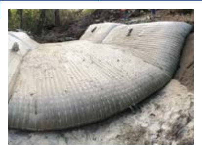
2015 Erosion control for watercourse over pipeline, France, gas pipeline