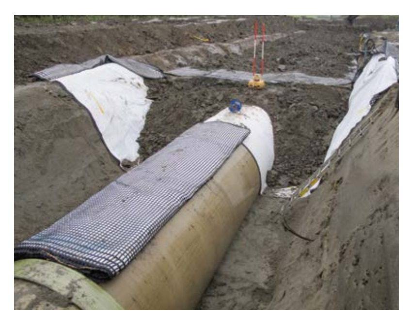
Ballasting of pressure sewage pipe Netherlands: protection against buoyancy and uplift with Basetrac Duo-C geocomposite.