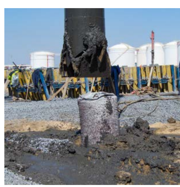
Ground improvement for oil tanks Spain: construction of safe, ductile foundation system in very soft soils with Ringtrac geotextileencased columns.