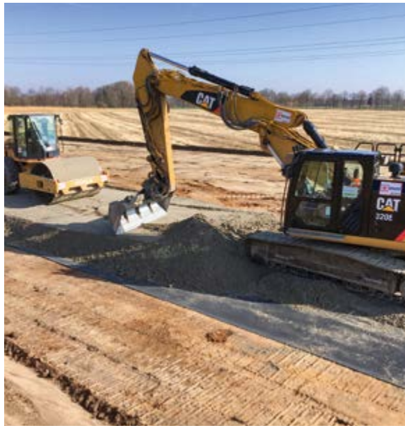
Loop Epe-Legden (LEL) natural gas pipeline, DN 1100 Germany: base reinforcement for continuous haul road alongside pipe trench and storage areas.