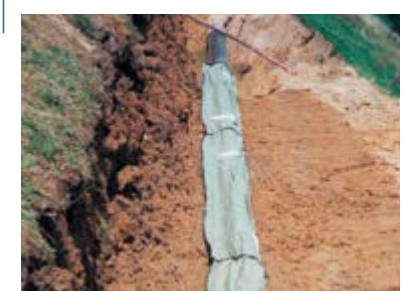
2006 Pipe cover, France, gas pipeline