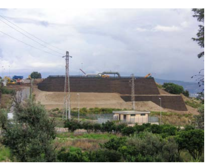
Modernisation of gas compressor station Italy: construction of extra-steep, low-settlement and settlement resistant slopes using geosynthetic reinforced soil method.